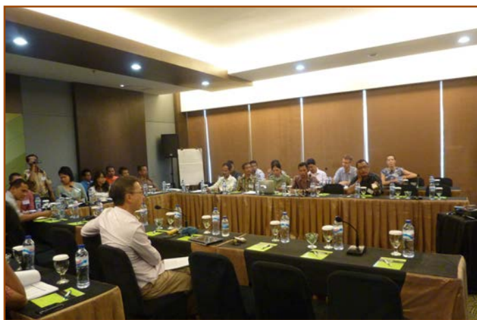
Multi-stakeholder consultation on HCVs 5 and 6 in Bogor, Indonesia

1 to 4 (values relating to biodiversity). The HCV 5 and 6 Protocol was revised based on the outcomes of two multi-stakeholder consultations held in Indonesia and Cameroon, attended by community members, local and national NGOs, palm oil companies, auditing bodies and researchers. The document was shared for wider public consultation through the High Conservation Resource Network, the RSPO Biodiversity and HCV Working Group, and the RSPO Roundtable in Medan, North Sumatra in November 2013.