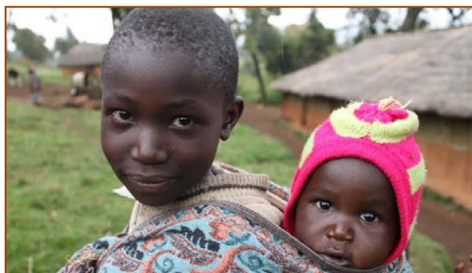
The Ogiek's bylaws will ensure the continued conservation of the Ogiek's ancestral lands, which will secure the futures of all generations of the community

FPP and CIPDP would like to acknowledge the support of the WF Southall Trust, Paul K. Feyerabend Foundation, Ford East Africa, TIDES and Synchronicity Earth.