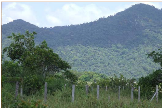
The proposed road would cut through pristine forest in the Wapichan territory

More information can be found here: http://guyaneseonline.wordpress.com/2013/11/18/guyanas-last-frontier-breached-by-road-from-brazil-ghra/