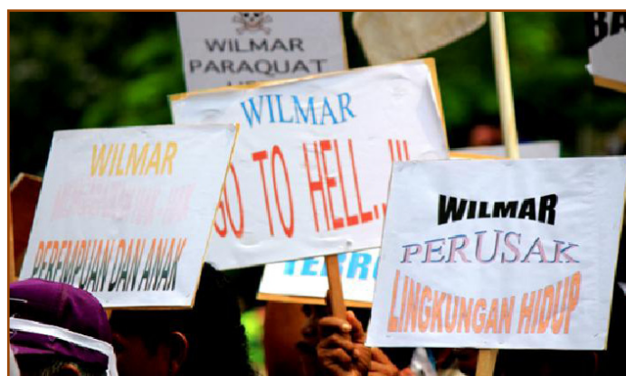
Wilmar International was the target of widespread protests held by plantation labourers and local communities at the RSPO Annual Meeting in Medan. Protesters called out against Wilmar for environmental destruction, paraquat use, the exploitation of children and women labourers and the violation of the rights of indigenous peoples.

The newly launched book was widely disseminated at the RSPO's 11th Annual Roundtable Meeting (known as 'RT11') on 11 - 14 November also in Medan. Over the course of RT11, Forest Peoples Programme co-led three Open Space Discussions on the HCV 5 and 6 Monitoring and Management Protocol , 24 FPIC and Conflict, and the newly formed RSPO Human Rights Working Group, in multi-stakeholder dialogues involving NGOs, auditors, companies, traders and smallholder oil palm farmers. This year's RT was also the scene of a joint protest by around 2,500 oil palm plantation labourers and affected local communities. They called in particular on the RSPO to sanction RSPO member company Wilmar International for its systemic violation of indigenous peoples', local communities' and labourers' rights in its concessions across Indonesia. A meeting was granted to representatives of the communities with RSPO representatives, in which a joint statement and petition were submitted, reiterating the protesters' demands and demanding immediate and concrete action and remedy for land grabbing and exploitation.