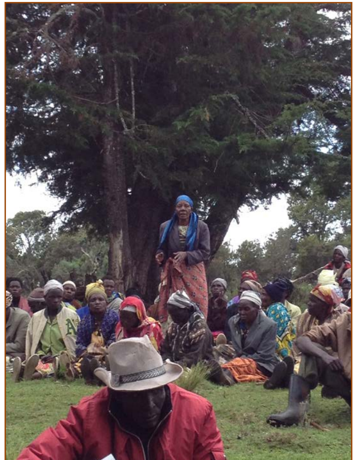
Women participants at the Ogiek’s customary bylaws meeting, April 2013