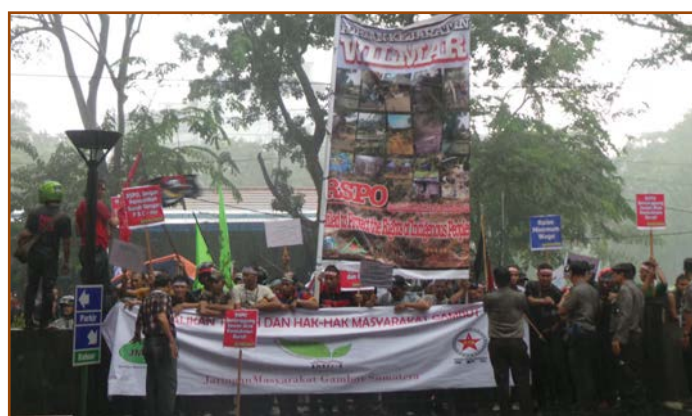
Protests started in Merdeka Square and spread to the RT11 venue and then the Office of the Governor of North Sumatra Province