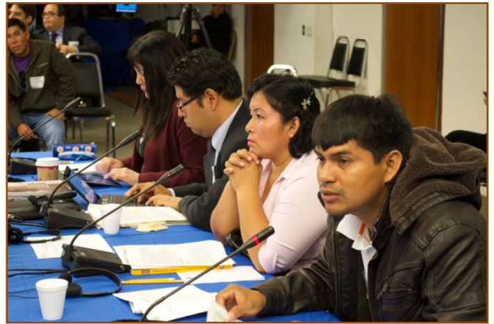
AIDSESEP, FENAMAD, DAR and the National Human Rights Coordinator at the Inter-American Commission hearing

These plans include the construction of 21 exploration