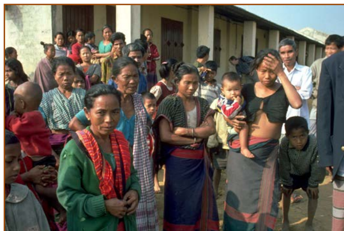
Internally displaced indigenous women in Chittagong Hill Tracts, Bangladesh. In order to effectively protect the rights of indigenous women their collective rights as indigenous peoples must be recognised and respected

Democratic Republic of Congo 11 and Colombia 12 have also substantially influenced the CEDAW Committee's jurisprudence. Also, indigenous women in Latin America are currently preparing a document that aims at guiding the Inter-American Commission on Human Rights in relation to dealing with cases involving indigenous women's rights violations. They presented an overview of the information at a hearing held by the Commission in March 2012.