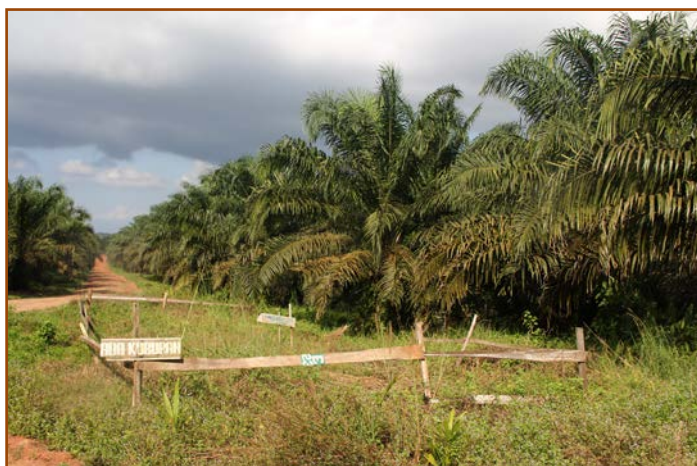
Palm oil companies must respect local communities' land rights and right to FPIC

of its concessions, PT Kartika Prima Cipta (PT KPC), in Kapuas Hulu in West Kalimantan and in Liberia in the concession of its wholly owned holding, Golden Veroleum Limited.