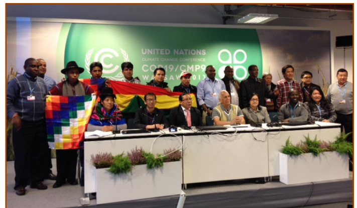
The International Indigenous Peoples Forum on Climate Change (IIPFCC) in Warsaw

and forest degradation and that addressing these drivers may have an economic cost and implications for domestic resources”). Indigenous Peoples were concerned that this ambiguous language could consider their livelihoods as drivers of deforestation, so raised the matter to Parties in an attempt to reformulate the sentence so it is clear that indigenous peoples' livelihoods are not to be considered as deforestation drivers but rather as contributors to forest conservation. Parties finally agreed to include a note in the COP report, clarifying that the text was not meant to stigmatise indigenous peoples' livelihoods.