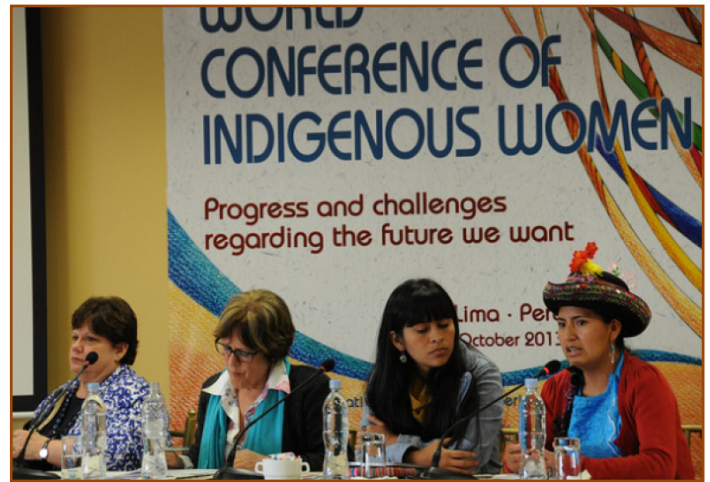
World Conference of Indigenous Women

Indigenous women and girls experience multiple forms of discrimination, lack of access to education and health care, high rates of poverty, maternal and child mortality.