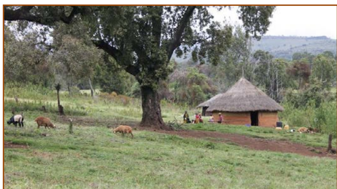
The ancestral lands of the Ogiek community, Mount Elgon, Chepkitale, Kenya

Although the ancestral lands of the Ogiek community at Chepkitale, Mount Elgon, were converted into a national game reserve without their consent in 2000 (making their presence there illegal), they clearly have the right to their ancestral lands under Kenya's 2010 Constitution, which recognises ancestral lands, and lands traditionally occupied by hunter gatherers such as the Ogiek, as community lands. The Ogiek have themselves been very involved in influencing Kenya's draft Community Land Bill that should recognise this right in law. However, the overriding approach to conservation in Kenya is still one that forbids human occupation of areas gazetted as national parks and forest reserves.