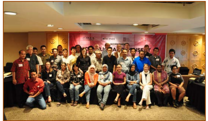
Participants of the Conflict or Consent workshop, Medan, North Sumatra

Presentations by the authors of the different case studies featured in ‘Conflict of Consent?’ were followed by lively and critical discussion and debate over the strengths and weaknesses of various conflict resolution avenues deployed by NGOs in support of local communities at the grassroots, national and international levels. These included inter-alia the Roundtable on Sustainable Palm Oil (RSPO)’s Complaints Panel and Dispute Settlement Facility, the International Finance Corporation Compliance Advisor/Ombudsman (IFC CAO), local and national courts, National Human Rights Commissions, companies’ own complaint mechanisms and Standard Operational Procedures, as well as land reclaiming, protest and community mobilisation. Particular concern was voiced over the rapid and ill-regulated expansion of oil palm plantations in West Africa, including in Liberia, Cameroon and Nigeria, by the same RSPO member companies that are neglecting the right of communities to give or withhold their free, prior and informed consent in Southeast Asia. A growing recognition of the need for South-South joint advocacy and networking was also