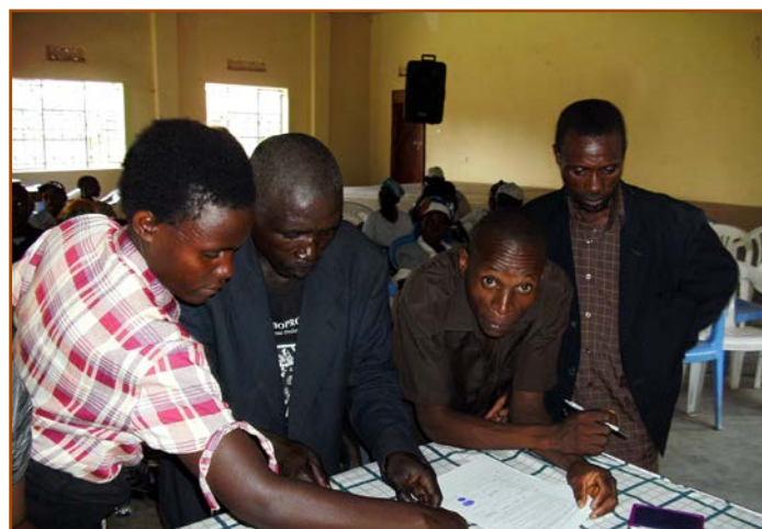
Batwa Representatives sign their declaration before delivery to the government, Kisoro, Uganda, Feb 2009

It is hoped that by opening spaces in policy, and supporting Batwa communities to utilize those spaces,