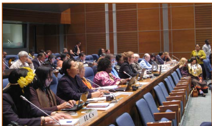
Indigenous peoples during the 8th meeting of the CBD Working Group on Article 8(j) and Related Provisions (WG8(j)-8)

Read the full closing statement of the IIFB here: http://www.forestpeoples.org/sites/fpp/files/private/news/2013/11/IIFB-SBSTTA17-Closing-Final.pdf