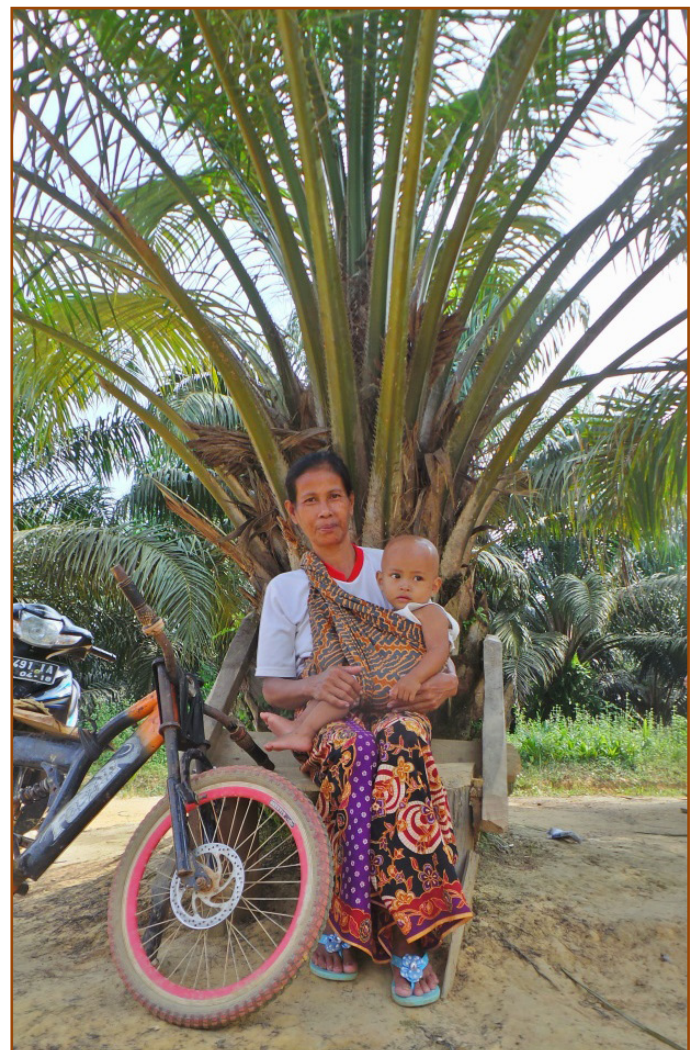
30 years after the imposed conversion of their customary lands for oil palm, the Batin Sembilan people are still denied justice and remedy

The new management of PT Asiatic Persada says it has chosen to continue mediation through an Integrated Team (Tim Terpadu) of Batang Hari district, in line with Presidential Instruction No. 2 of 2013 on Handling Disturbances to National Security. This team will include government representatives, the military and the police. None of the communities involved in the IFC CAO mediation were consulted on this decision. This suggested mediation option is also technically flawed, given that PT Asiatic Persada is located in two districts, and that therefore according to the law, it is the Provincial Government who should take on the responsibility to continue the conflict resolution process, not the district government of Batang Hari. Furthermore, the mediation