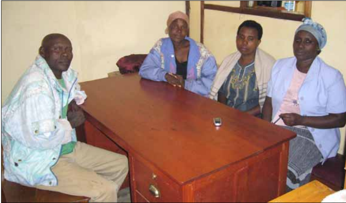
Members of UOBDU being interviewed for the review

In the process of carrying out this review the authors are grateful to their colleagues and partners who were interviewed and generously gave up their time to provide their own experiences and information. In particular the authors would like to thank the Batwa interviewees, the Honourable Minister for Environment, Bwindi Mgahinga Conservation Trust (BMCT), CARE Uganda (CARE), Global Environment Facility – Small Grants Programme (GEF-SGP), Institute for Tropical Forest Conservation (ITFC), International Gorilla Conservation Programme (IGCP), International Union of Conservation Networks (IUCN), Ministry of Water and Environment (MWE), National Environmental Management Authority (NEMA), National Forestry Resources Research Institute (NFRRI), Nature Uganda (NU), Uganda Wildlife Authority (UWA) United Organisation for Batwa Development in Uganda (UOBDU), World Conservation Society (WCS), and the World Wide Fund for Nature (WWF).