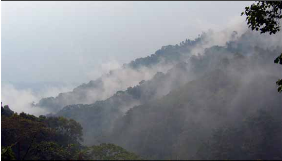
Mist rising from Bwindi Impenetrable National Park

The British colonial administration first established protected areas out of the Batwa's forests in the 1930s, measures which probably served to protect the forests from complete destruction by the incoming cultivators and pastoralists who were eager to utilise the fertile lands. Nonetheless, despite this infringement upon their land rights, the Batwa continued to consider the forests as theirs, to worship their ancestors there, and to use the forest to derive their livelihood and practice their culture. The chief objective of the conservation measures was the protection and preservation of the Mountain Gorilla and it seems that the initial colonial measures were contradicted by the conservation measures which would follow. In 1930 one administrator's wife wrote that,