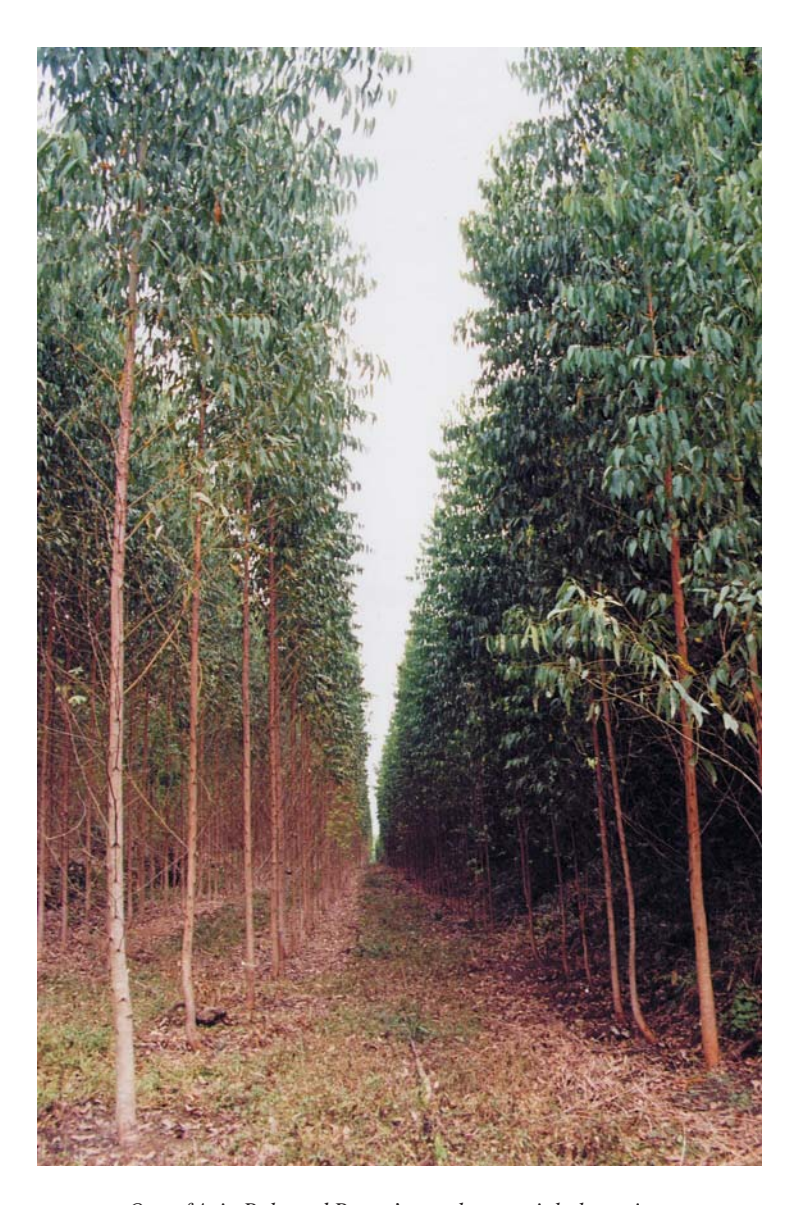
One\ of Asia\ Pulp\ and\ Paper's\ eucalyptus\ trial\ plantations.