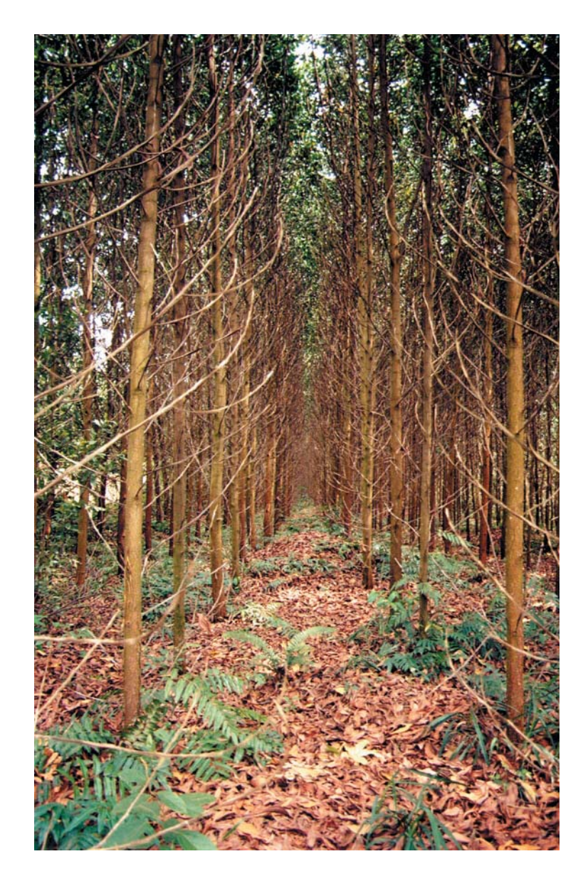
One of Asia Pulp and Paper's acacia plantations.