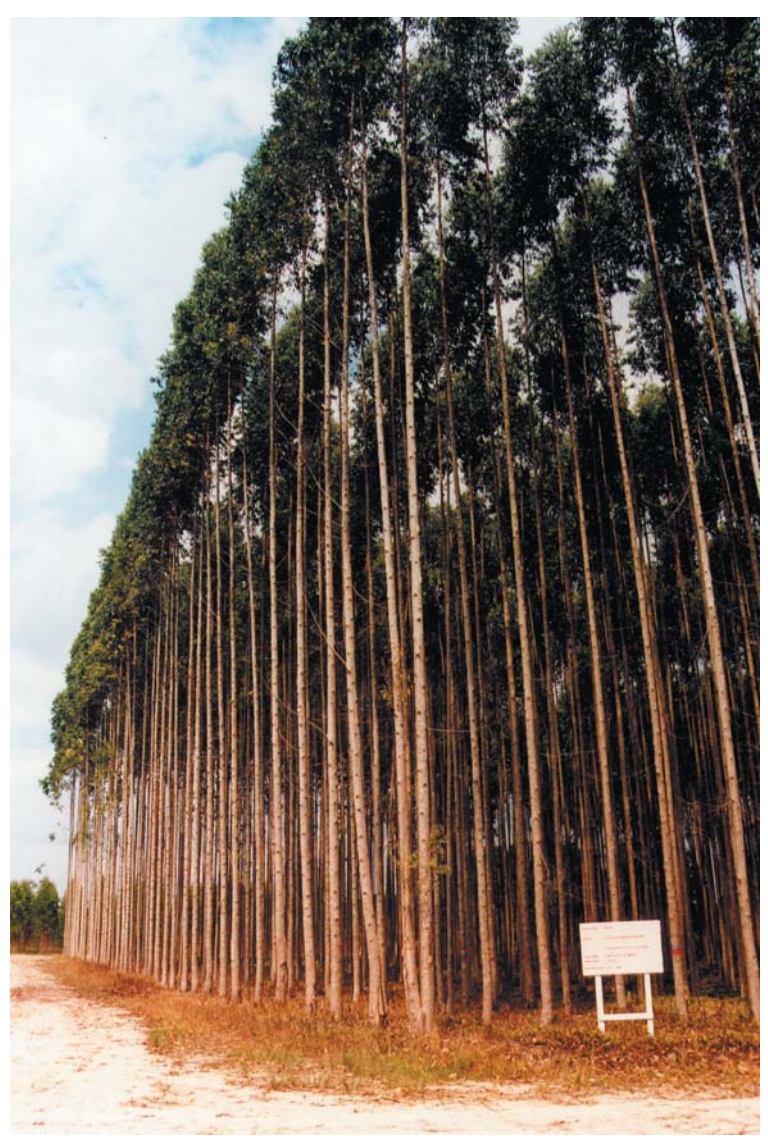
One of Asia Pulp and Paper's eucalyptus trial plantations. APP's monoculture is replacing forest, and in the process destroying local livelihoods.