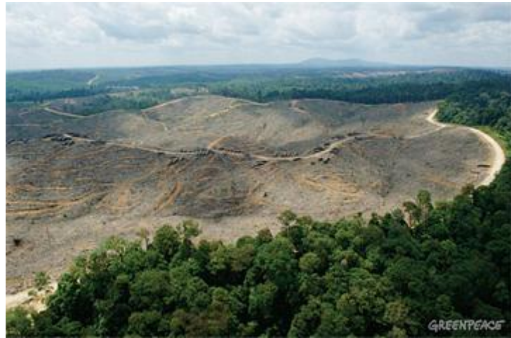
Forest clearing in the Bukit Tigapuluh Forest Landscape in central Sumatra.

So APP has not yet committed to no conversion of forests with more than 35 tons carbon but has committed to – and we have started – a HCS study of its supply base. It has also committed to resolving social conflicts and to FPIC and we have started work on that as well. The work on HCVF has started too.