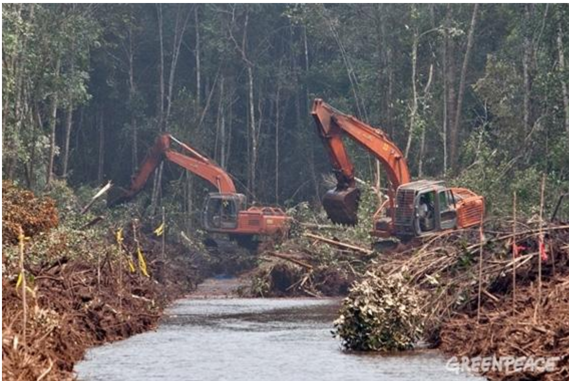
Forest clearing by PT Asia Tani Persada in late September 2012.

Editor's note: the photo and corresponding caption immediately below were updated to reflect new information from Greenpeace on September 28, 2012