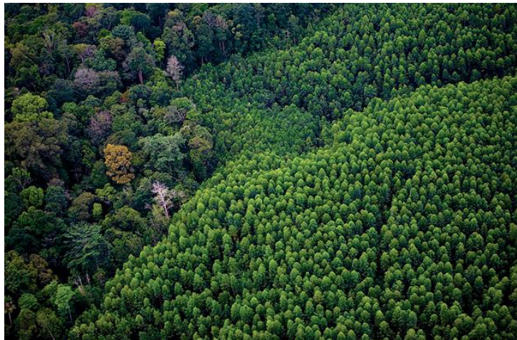
Eucalyptus plantations east of Pekanbaru.

While APP has publicly downplayed any connection with the new mill in South Sumatra, media reports indicate that the project is backed by Sinar Mas Group, the conglomerate that owns APP. The pulp mill will allegedly have a capacity of 2 million tons per year and cost some $3 billion. Sinar Mas recently secured a $250 million loan from an unspecified bank in Indonesia, according to the Investor Daily , a sign that the conglomerate may be overcoming investor concerns tied to its $13.9 billion default in 2001.